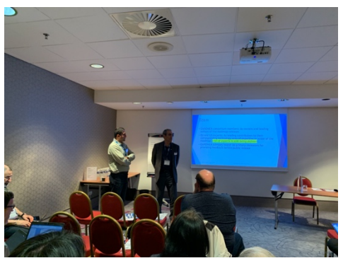
Figure 1 - EMPOWER-PAWR joint meeting

The main objective of the joint meeting was liaised key persons in Europe and USA to share information and start discussing possible joint activities related to advanced wireless platforms at both sides of the Atlantic towards 5G and beyond 5G technologies. In addition, the ongoing work of the three ICT-17-2018 projects (5G-EVE, 5G-VINNI, 5G-GENESIS) and the ongoing NSF PAWR projects (COSMOS, RENEW, POWDER) were presented. Each of these projects shortly highlighted the services provided by their projects, the infrastructure available at this stage and their roadmap.